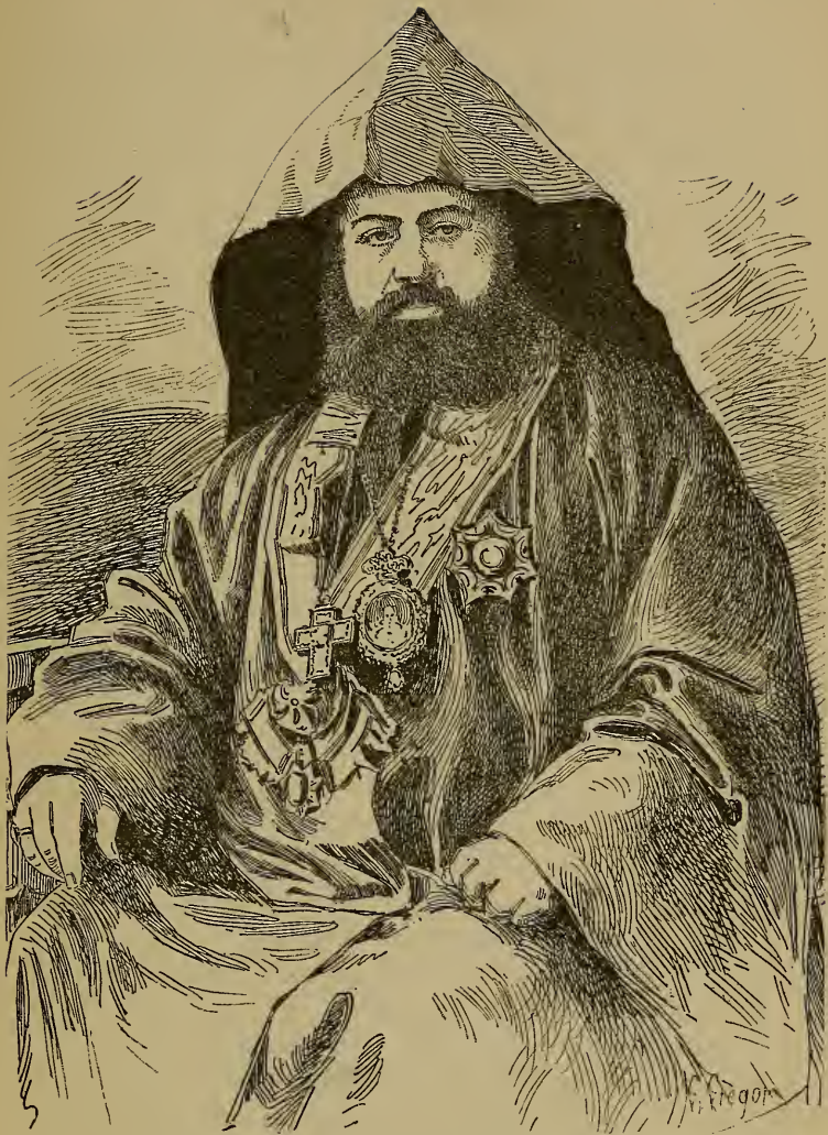
BISHOP NERSES, THE LATE PATRIARCH OF CONSTANTINOPLE.